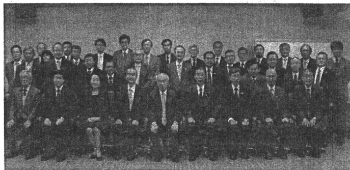
Science Council of Japan and Representatives of 30 Academic Societies, November 29, 2014

In March 2015, Japanese Association for Disaster Medicine held the twenty-anniversary symposium with Academic Society Liaison Association. This was the memorable discussion of medical doctors and scientists. We also welcome a new member of Japan geoscience union. Interdisciplinary collaboration is going to spread steadily.